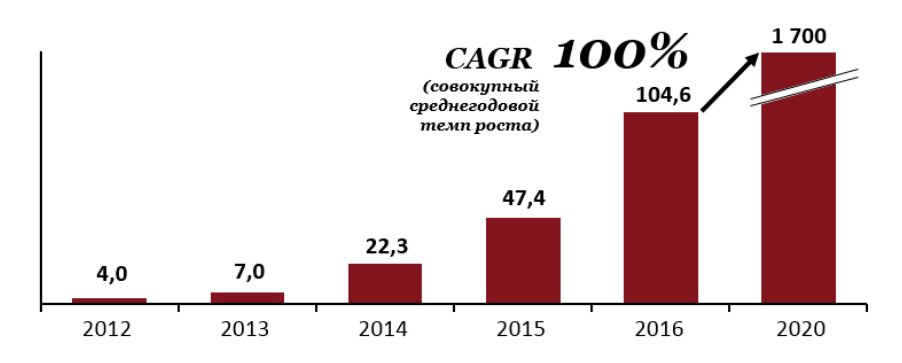
Asia-EU-Asia transit container traffic via Kazakhstan (Samruk-Kazyna, 2017)

The Nurly Zhol program opens wide opportunities for the development of transport potential, both in Kazakhstan and in the Central Asian region as a whole. The implementation of the international strategy for building the economic belt of the Silk Road requires the creation of a modern transport and logistics infrastructure, throughout its entire length. Kazakhstan, as a participant of this project, thanks to the program «Nurly Zhol» increases its transport capabilities and, including through international cooperation, has every chance of becoming a major transport and logistics hub, which will positively affect the country's economy. The strategy of building the economic belt of the Silk Road is supported by all countries involved in this project, as it can create a powerful push for development and thousands of new jobs.